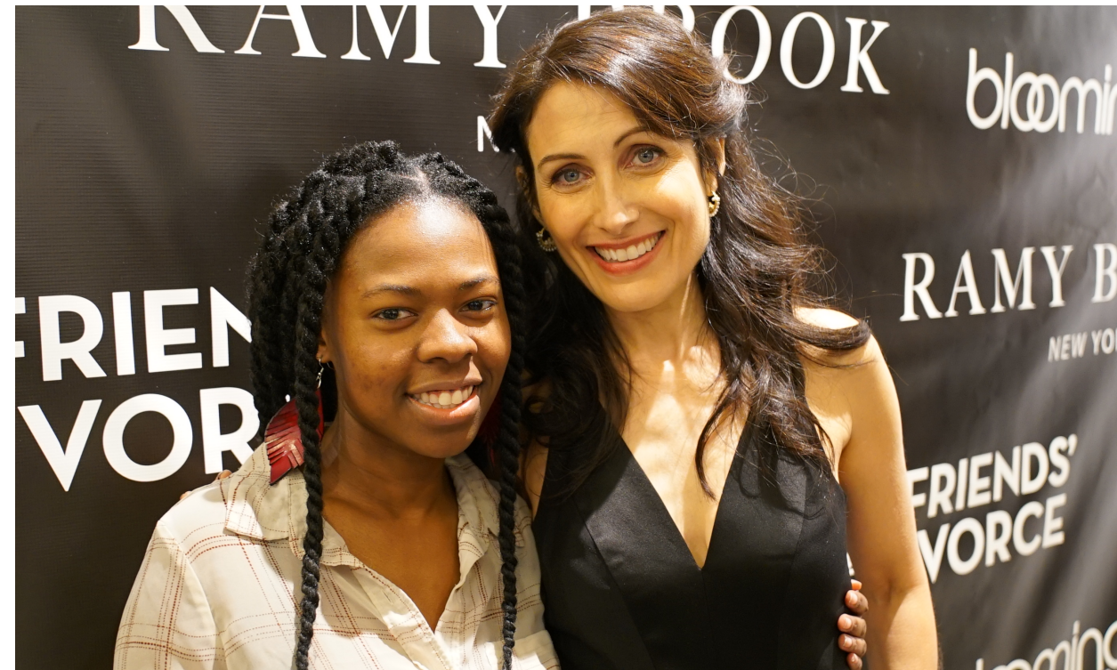
LISA EDELSTEIN FROM GIRLFRIEND'S GUIDE TO DIVORCE