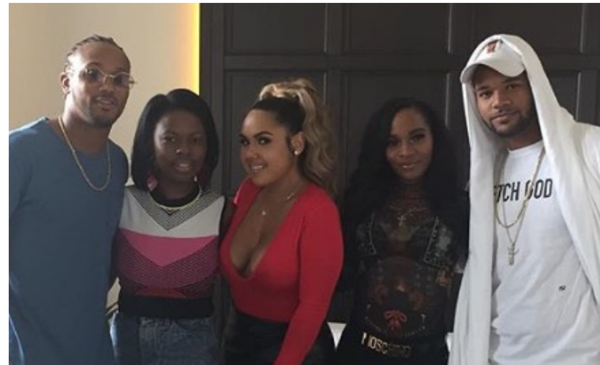
CAST OF WETV'S GROWING UP HIP HOP