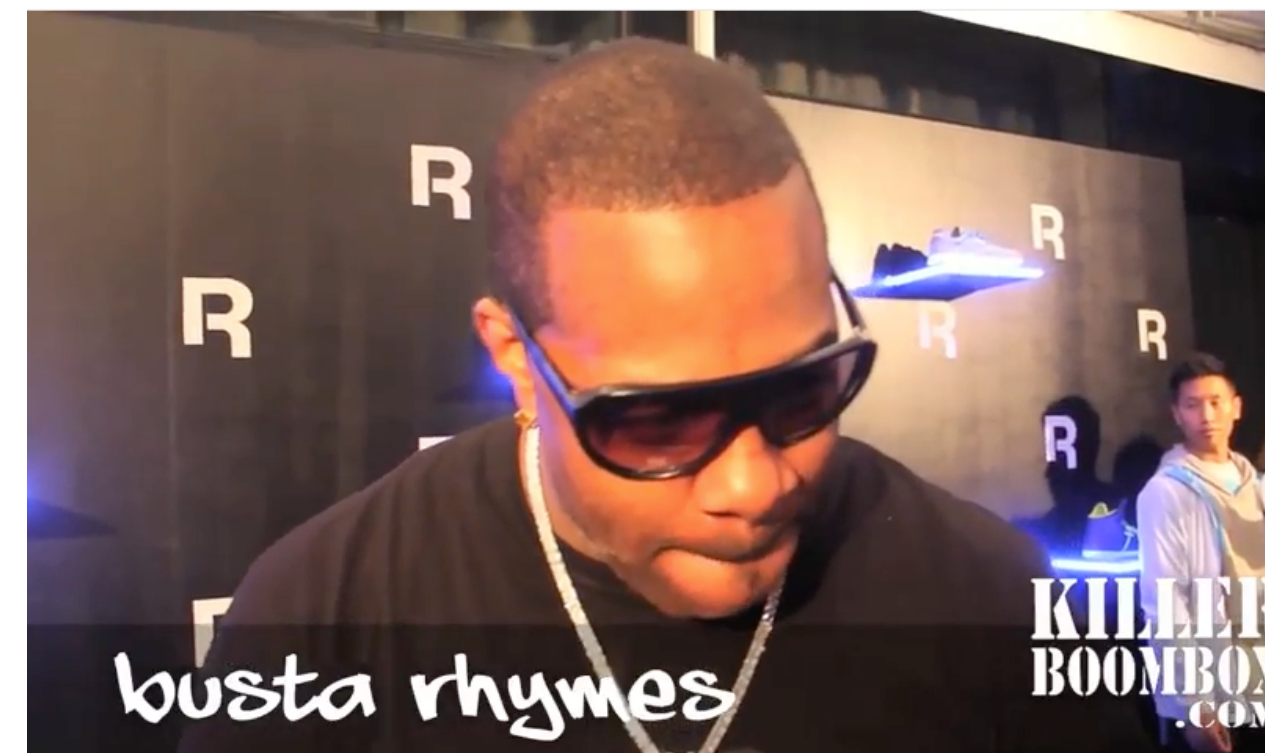
NYC REEBOK EVENT X BUSTA RHYMES